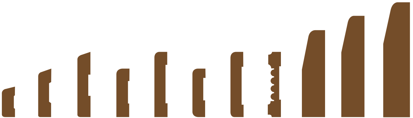
B13 42 x 18 S.Bev HT B1 67 x 18 S.Bev HT B2 90 x 18 S.Bev HT B5 67 x 18 S.B.N. B6 90 x 18 S.B.N. B7 67 x 18 D.B.N. B8 90 x 18 D.B.N. B100 90 x 19 Reeded (to order) B34 120 x 32 Ave Block B35 140 x 32 Ave Block Pine 190 x 42 Ave Block